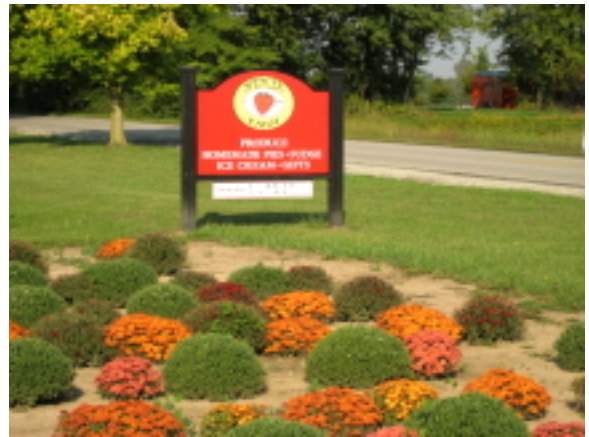
Come experience our vibrant colors of fall!

have several colors to choose from: red, gold, white, orange, yellow and purple. Peruse our market with unique gourds, Indian corn and other fall decorations.